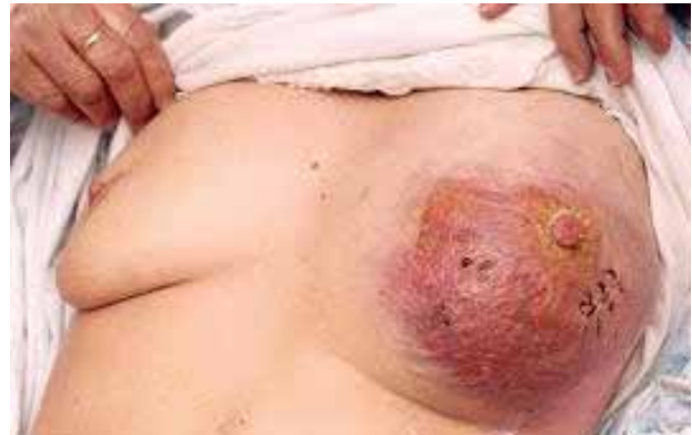
Fig 1. Diffuse swelling of the anterior part of the left breast with erythema warmth, and tenderness on palpation mimicking partially a peau d'orange phenomenon.

A 63-year-old female patient was admitted to our clinic with swelling in the left breast and arm, and enlarged left axillary lymphadenopathy. On physical examination; diffuse swelling of the anterior part of the left breast with erythema, warmth, and tenderness was detected by palpation, which was mimicking partially a peau d'orange phenomenon (Figure 1). Two lymph nodes with a diameter of two centimeters were detected in left axillary region. The infra- and supraclavicular regions and right breast were normal. Patient had undergone radical gastrectomy because of gastric SRCC one year ago, and afterwards she had been treated with adjuvant chemoradiotherapy. After diffuse swelling of left breast, we performed biopsy and in histopathologic examination diffuse infiltration of SRCC was determined (Figure 2). Immunohistochemical staining for ER and PR and CK7 were negative, CK20 and